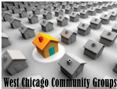
West Chicago Community Groups

Community Groups are scheduled to meet TODAY . "...They broke bread in their homes and ate together with glad and sincere hearts, praising God and enjoying the favor of all the people. – Acts 2:46-47