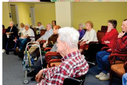
Franciscan Court quilt class.