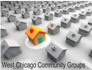
West Chicago Community Groups