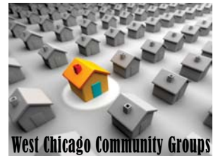
West Chicago Community Groups

“...They broke bread in their homes and ate together with glad and sincere hearts, praising God and enjoying the favor of all the people. And the Lord added to their number daily those who were being saved. – Acts 2:46-47