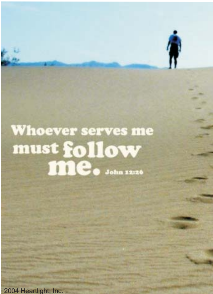
2004 Heartlight, Inc.

350 East James Avenue West Chicago, Illinois 60185 (630) 231-2062 wcfamily@wcfamily.org www.wcfamily.org