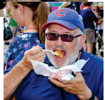
Top L: Biggest Pig (1335 lbs.); Top R: Biggest Pumpkin (933 lbs.); Center: Biggest Bull (2646 lbs.); Bottom L: Deep Fried Twinkie; Bottom R: Deep-Fried Butter.