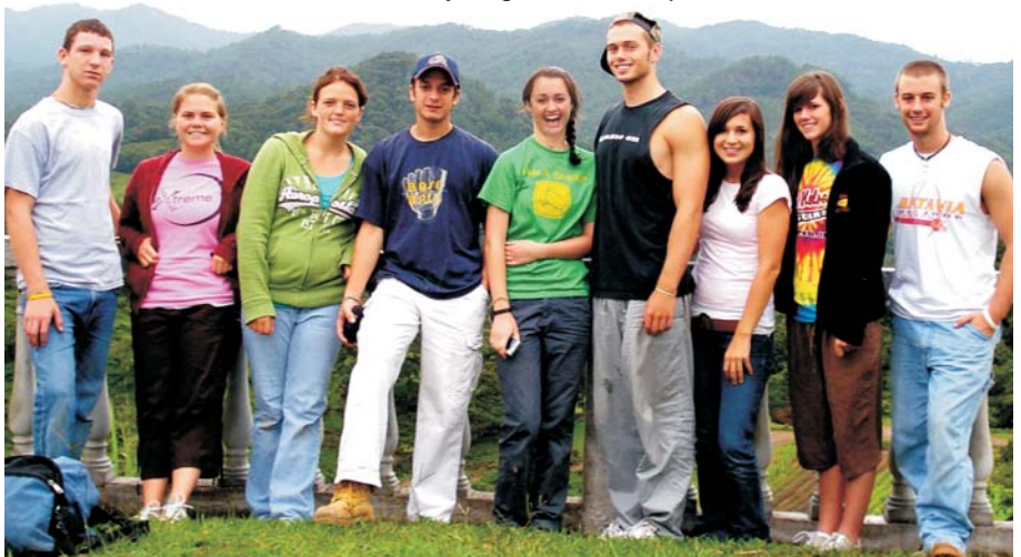
The youngest members of our Honduras mission team.

The Shults-Lewis Annual Day, is Saturday, September 20 , beginning at 8:00 a.m. in Valparaiso. The schedule consists of: breakfast from 8:00 - 10:00; crafts and food booths from 9:30 - 2:30; auction from 11:00 - 2:30; and tours of the campus will be given at 10:30 and 12:30. Check out their website, www.shultslewis.org , for information and photos from last year.