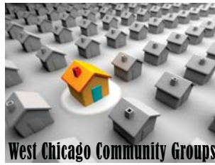
West Chicago Community Groups

Community Groups are scheduled to meet TODAY. "...They broke bread in their homes and ate together with glad and sincere hearts, praising God and enjoying the favor of all the people. – Acts 2:46-47