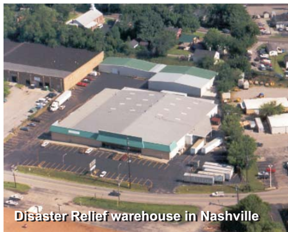
Disaster Relief warehouse in Nashville