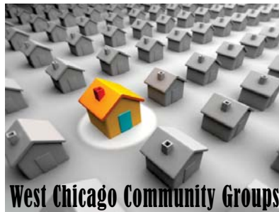
West Chicago Community Groups

Community Groups are scheduled to meet today. The list of groups is posted on the bulletin board in the foyer. A couple of reminders from last week's sermon: Our purpose for the Community Groups is to 1) provide time together in a less structured setting than our Sunday morning worship and 2) grow in love by connecting with others. Some questions to ask yourself, "How can I give more of myself?" and "How is the enemy blinding me to the beauty and goodness of the saints?"