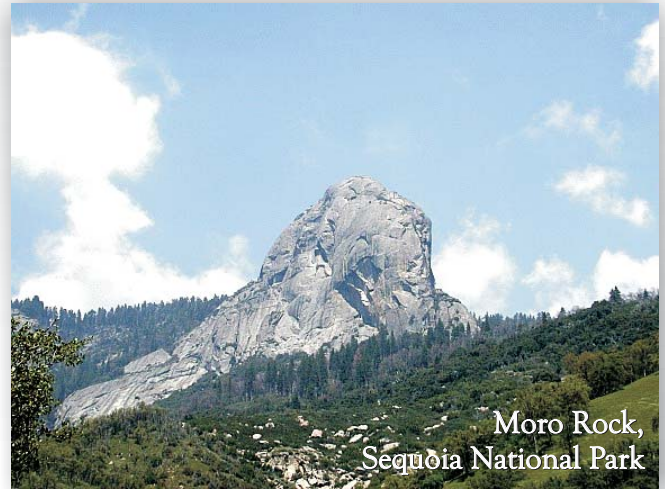
Moro Rock, Sequoia National Park

Other scenes of spectacular beauty have been in Honduras, looking out from the site of the new church in Las Pitias, or the amazing valley which lies below the refuge in Las Palmas where the facilities for the children overlook a valley beyond words to describe. It is ironic that children so burdened by poverty live in the luxury of creation joy which speaks to them every